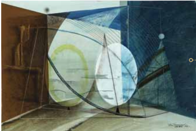
JOHN TUNNARD, A.R.A. (BRITISH 1900-1971)