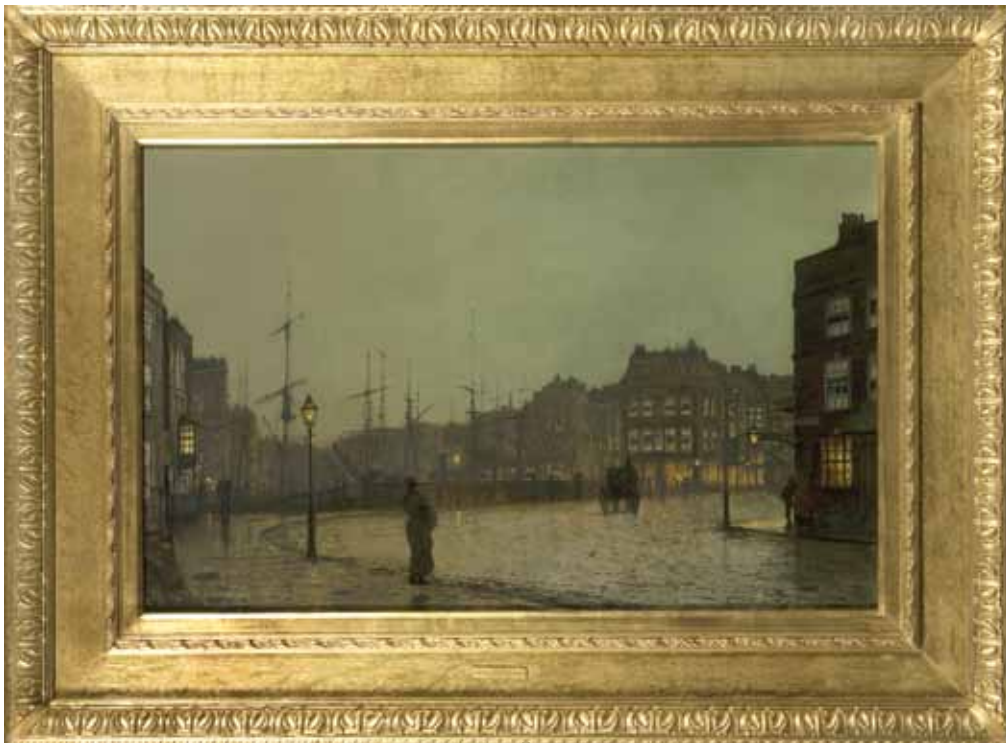
John Atkinson Grimshaw (British, 1836-1893) Greenock. Oil on canvas. 20 x 30 inches. Signed.